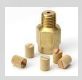
R022 – Pressure Filter Kit Filte Kit includes Snubber